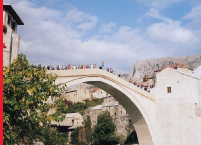
Top picture: Mostar bridge in the former Yugoslavia, destroyed in fighting. Bottom picture: Mostar bridge after being rebuilt in 2004